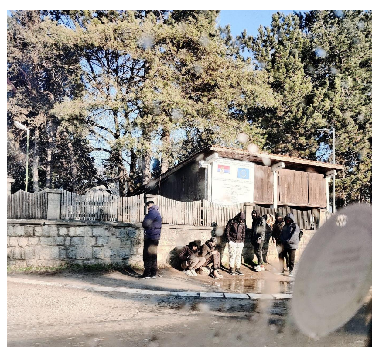
People on the move looks for shelter in Obrenovac Asylum Centre, near Belgrade.